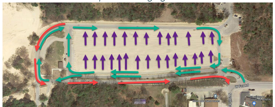
Equestrian staging area

Vehicles without horses must park in the pedestrian parking area, 8890 West Shore Dr. in Mears.